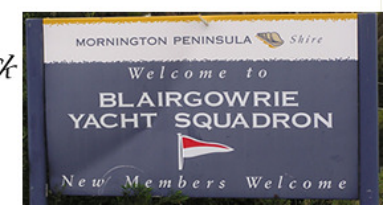
Blairgowrie Marina – Port Phillip Bay 1 Melway Map Ref : 167 E1

Dive is shore entry and across the sea grass beds, or off the jetty landing approximately 180m out along the walkway.